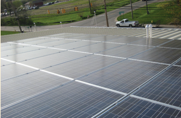
Oberlin's new solar roof.